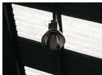
Low energy lighting

Creating an Energy and Environmental Working Group to reduce the company’s carbon footprint