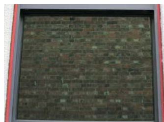
Solar Film on office windows